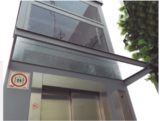
Canopy over door (metal sheet or glass)