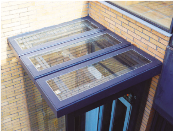
Ceiling (metal sheet or glass)