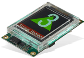
EAZ-TFT-45 2,8" NEWLIFT