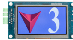
TFT 2385 LESTER