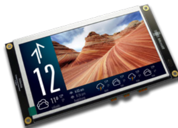
7" CARLOS SILVA