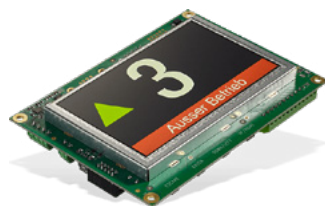
EAZ-TFT-110 5" EAZ-TFT-210 10,3" NEWLIFT