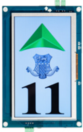
TFT 2381 LESTER