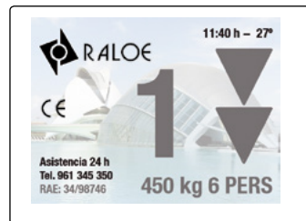
TFT 5,6" CARLOS SILVA