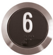
Bas 120 Black