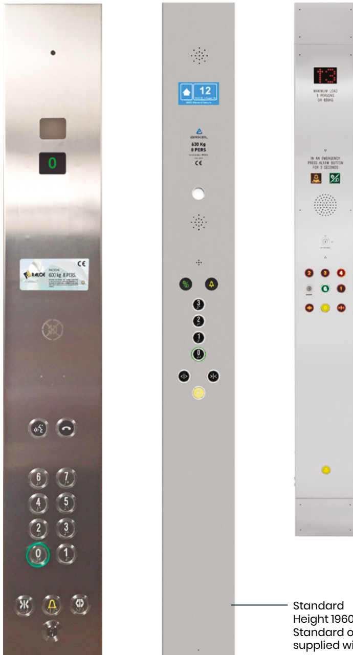
Standard Height 1960 mm Standard only for lifts. For Home Lift, supplied without display.